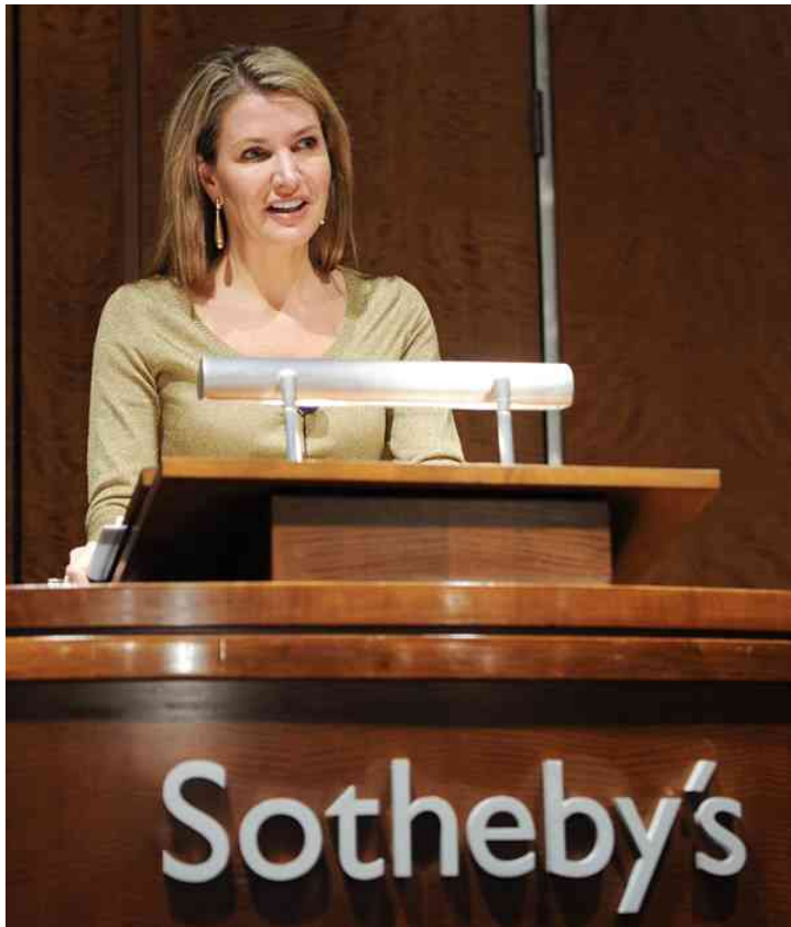
Sotheby's, New York City.