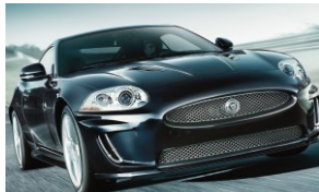
Cars That Depreciate Fastest