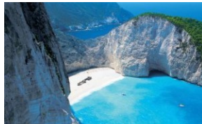
Vacations that Will Change Your Life