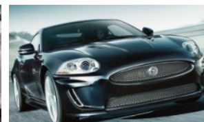
Cars That Depreciate Fastest