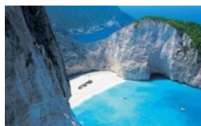
Vacations that Will Change Your Life