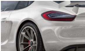
Porsche Announces One of Their Slickest Cars Yet