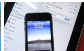
How to Get WiFi Anywhere at Any Time