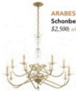
ARABESQUE Schonbek | Starting at $2,500; schonbek.com