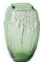
MUGUET VASE Green crystal Lalique | $4,300; lalique.com