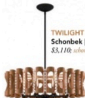
TWILIGHT Schonbek | Starting at $3,110; schonbek.com