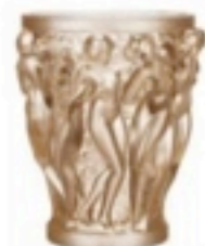
BACCHANTES VASE Gold luster crystal Lalique | $5,700; lalique.com